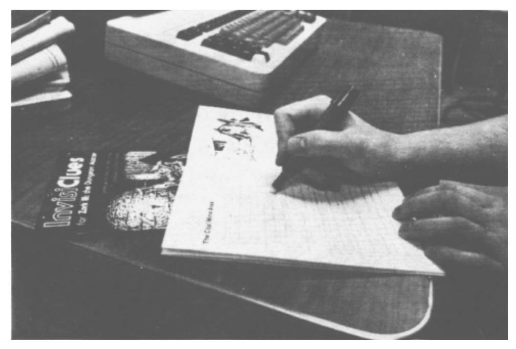
InvisiClues . PC magazine called them, "almost as much fun as Zork ." They are fun, and quite useful, too. Even experts who have finished the game will find out about things they missed.

Our last issue highlighted quite a few reviews and many comments from users. Since then we've received one comment which we must share with you (it's in regard to Zork II): "Awesome, awesome, awesome. I get tingles all over from the excitement it brings." (!)