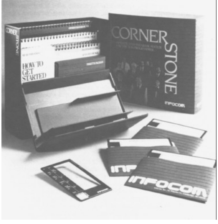
Cornerstone: The sophisticated database system for the non-programmer.